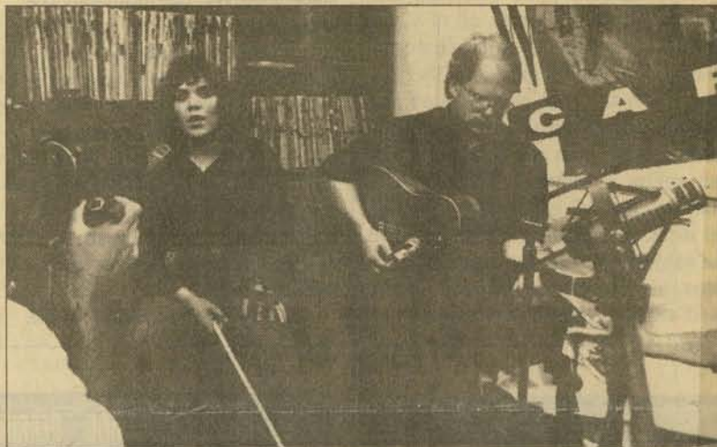
Fiddler Alison Krauss, a Rounder discovery, in "True Believers."